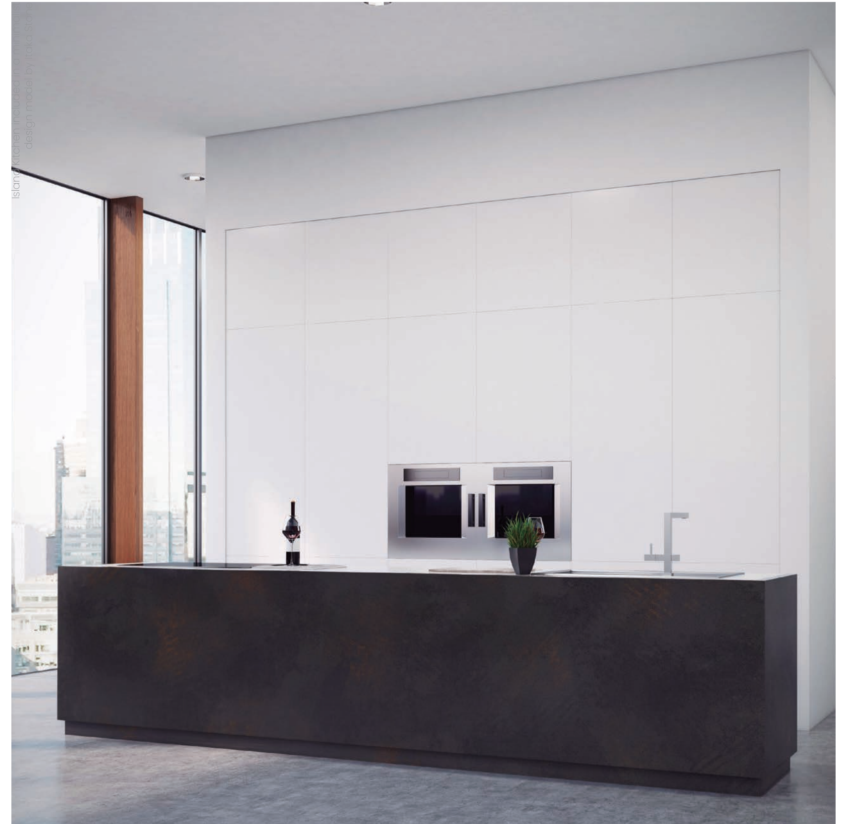
Island kitchen included in our minimalist design model by Itaka Stone

Sizes 1400 x 3000 mm & 1600 x 3200 mm Thickness 20 mm & 30 mm Finish Polished