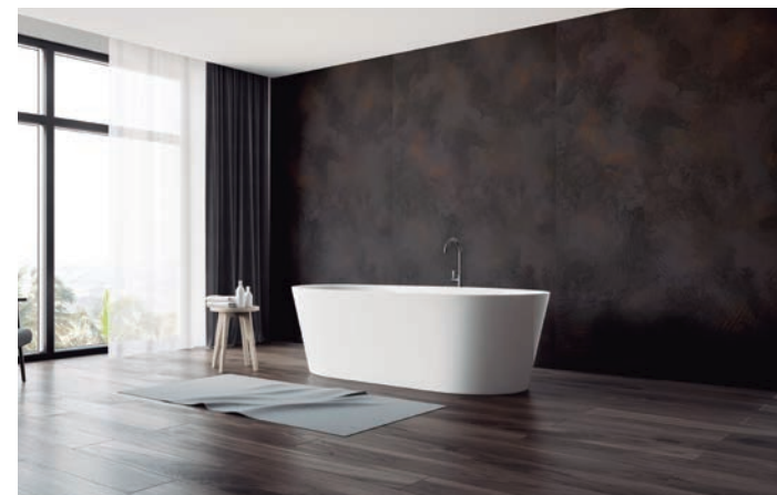
Bathroom walls made with Cronus by Itaka

OXID CHARACTER . METAL . IRREGULAR DARKNESS . URBAN